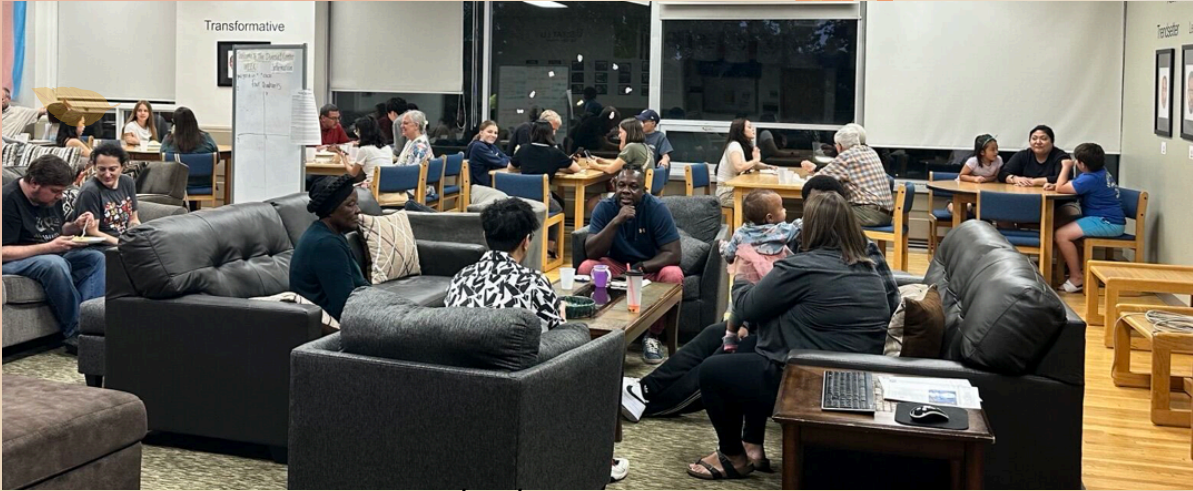
Photo of Welcome Dinner 9/28/2024